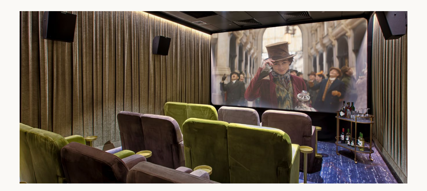
OUR 16-SEAT SOFA CINEMA THEATRE, IDEAL FOR PRIVATE EVENTS